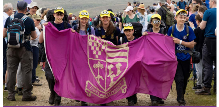
Ten Tors & Duke of Edinburgh Award