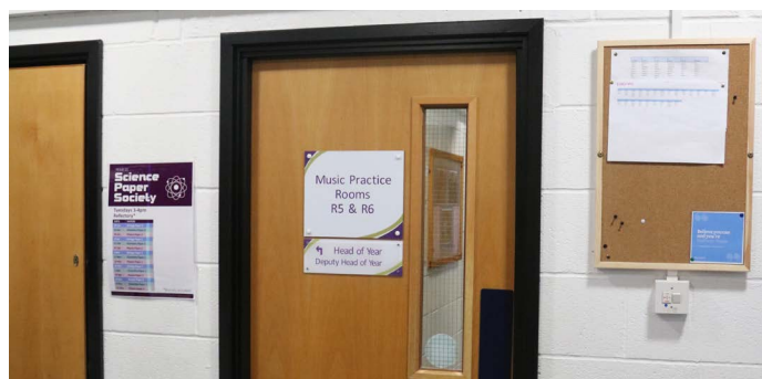
Year 7 Office