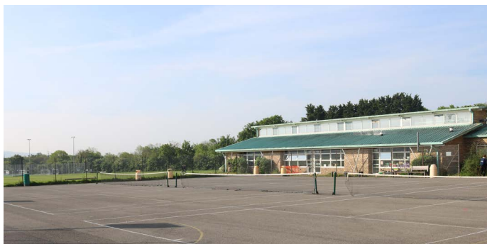
Year 7 Playground

Sheldon is much bigger than your primary school, but you will soon learn how to find your way around. If you need help, ask a member of staff or a Prefect. Some important places to find are the Year 7 Playground where you will arrive on your first day, the Refectory where you can buy lunch, the library and Year 7 Office.