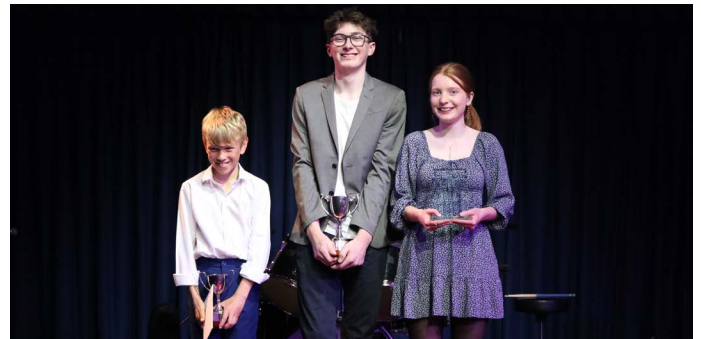
Young Musician of the Year