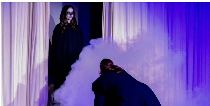
Whole School Production