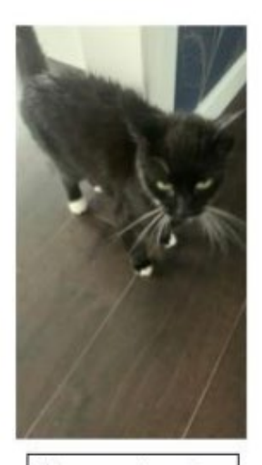
My cat when the rain comes in