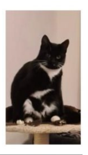
My cat after one too many pork pies at christmas