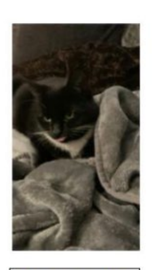
My cat tasting the air