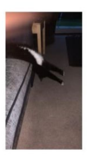
My cat mid stretch