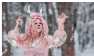
What is Modern Paganism? Professor Ronald Hutton Wed, 18 Sep 2024