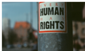
Human Rights Law: Bringing Power to the Powerless

Prof Clive Stafford Smith Thu, 19 Sep 2024