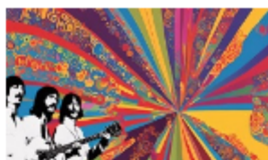
Magical Mystery Tour: The Invention of The Beatles Prof Milton Mermikides Thu, 12 Sep 2024